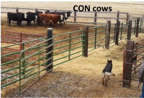
Figure 1. Behavioral responses of beef cows during the simulated wolf encounter.

Chute score increased (P = 0.01) from pre- to post-exposure assessment in WLF cows but did not change in CON cows (P = 0.72), indicating that the simulated wolf encounter increased fear-induced agitation during chute restraining only in WLF cows (Burrow, 1997). Accordingly, WLF cows had a