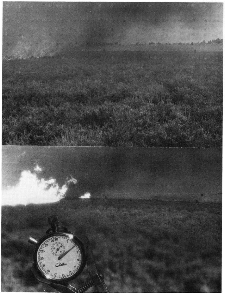
Fig. 3. Photographs taken simultaneously with panchromatic (top) and infrared (bottom) black and white films. Stop watch in the infrared photograph was used to record time in a series of photographs.

During the experimental burns, 8 infrared photographs were taken per burn. Data